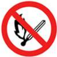
No Naked Lights