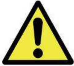
General Danger (BS 5378)

PS 2.1 The general danger sign must be appear on the exterior of the chemical store. If the chemical store forms a part of a larger building then a general danger sign must be mounted on the exterior of larger building by the entrance.